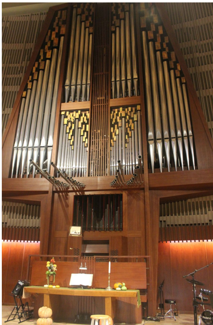
The Rieger organ at the Pacific Union College Church in Angwin is the largest of its kind on the West Coast.