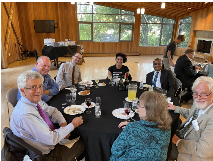
Dinner at St Stephen's in Belvedere.