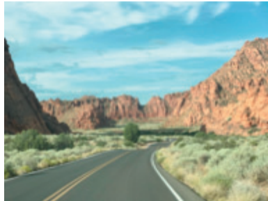
Our first RV trip through the Canyons