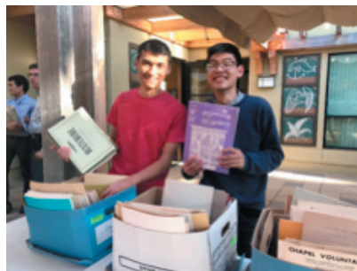
Perusing boxes of free organ music