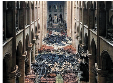
Devastation following the April 15, 2019, fire at Notre Dame Cathedral, Paris

April 15, 2019. Tears throughout France and the world beyond began to flow as images of the iconic Notre Dame Cathedral ablaze saturated the internet. Adding to the despair were drone images showing aerial views of the cathedral, red with fire, presumably the entire length of the sanctuary. Our